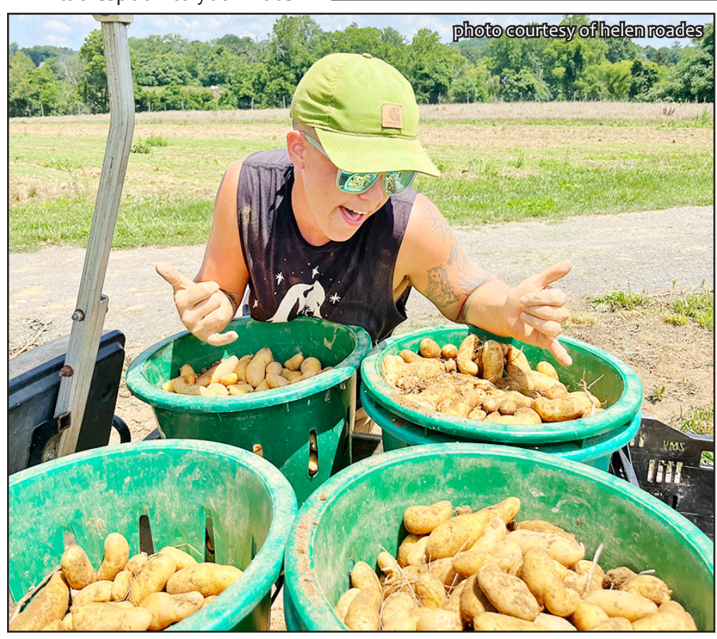
Oscar admires the chunky fingerling potatoes — they only got watered once, but they are big and beautiful.

We can be like water, my friend. We can find a way around. Through it. We can ride along in a seven gallon jug perched atop shoulders of farmers walking with their moon shadows. Find a way through the rocks of the river bed. Millenia's worth of friction. Still, to this day, it's never been the same river twice. We can be like water. Reaching roots, rain clouds' release. Replenishing pleases. We can ride along in one gallon jugs in vans market bound. Where water wets asphalt weekly after sustaining bouquets. Bundles of delight. Be like water, stirred, as paws paddle. Muskrat passes. My friend, we are water. Salty tears on cheeks. Hydro incubation. Refilled bowl for good dogs, sneaky dogs, any dog. Greenhouse hose, watering watering watering. Water, my friend, water. -OHC