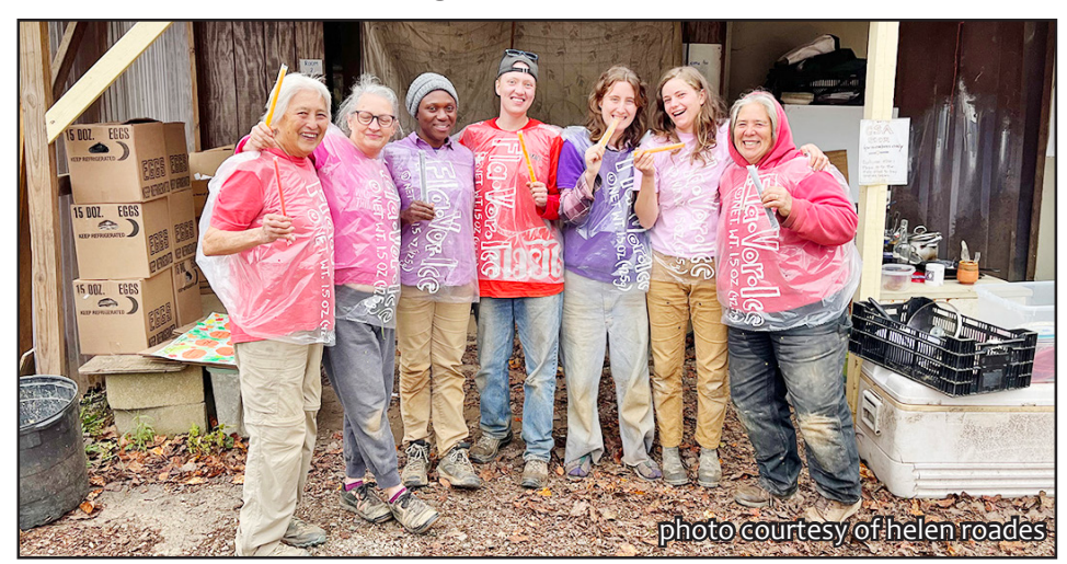
Dressing up as Freezie Pops for Halloween in 2022.

Exotic and light. A melodic blend of 20 or more flavors that cannot truly be picked apart and probably shouldn't. Delightfully pink on the nose. Pairs wonderfully with the sigh of relief after a day well worked.